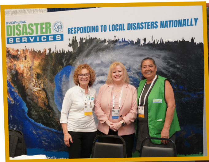
EXHIBIT HALL LAYOUT COMING SOON!